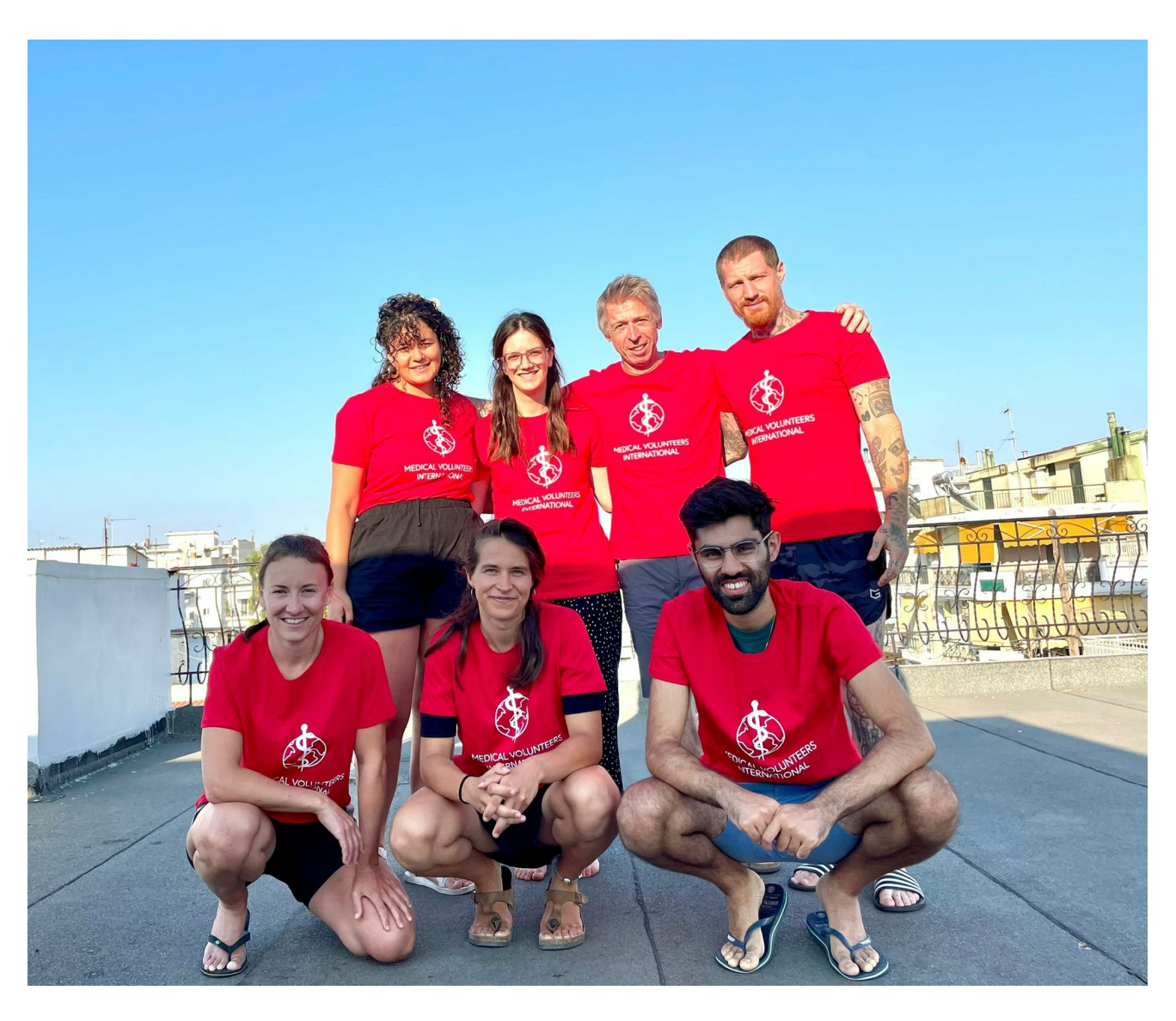
MVI team in Thessaloniki