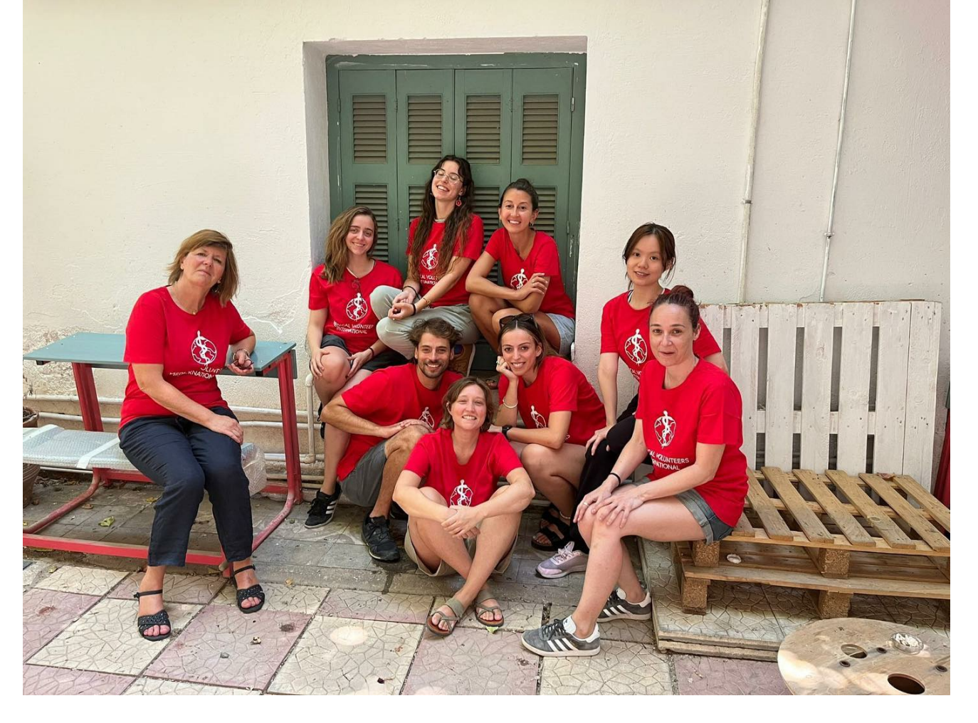
MVI team in Athens