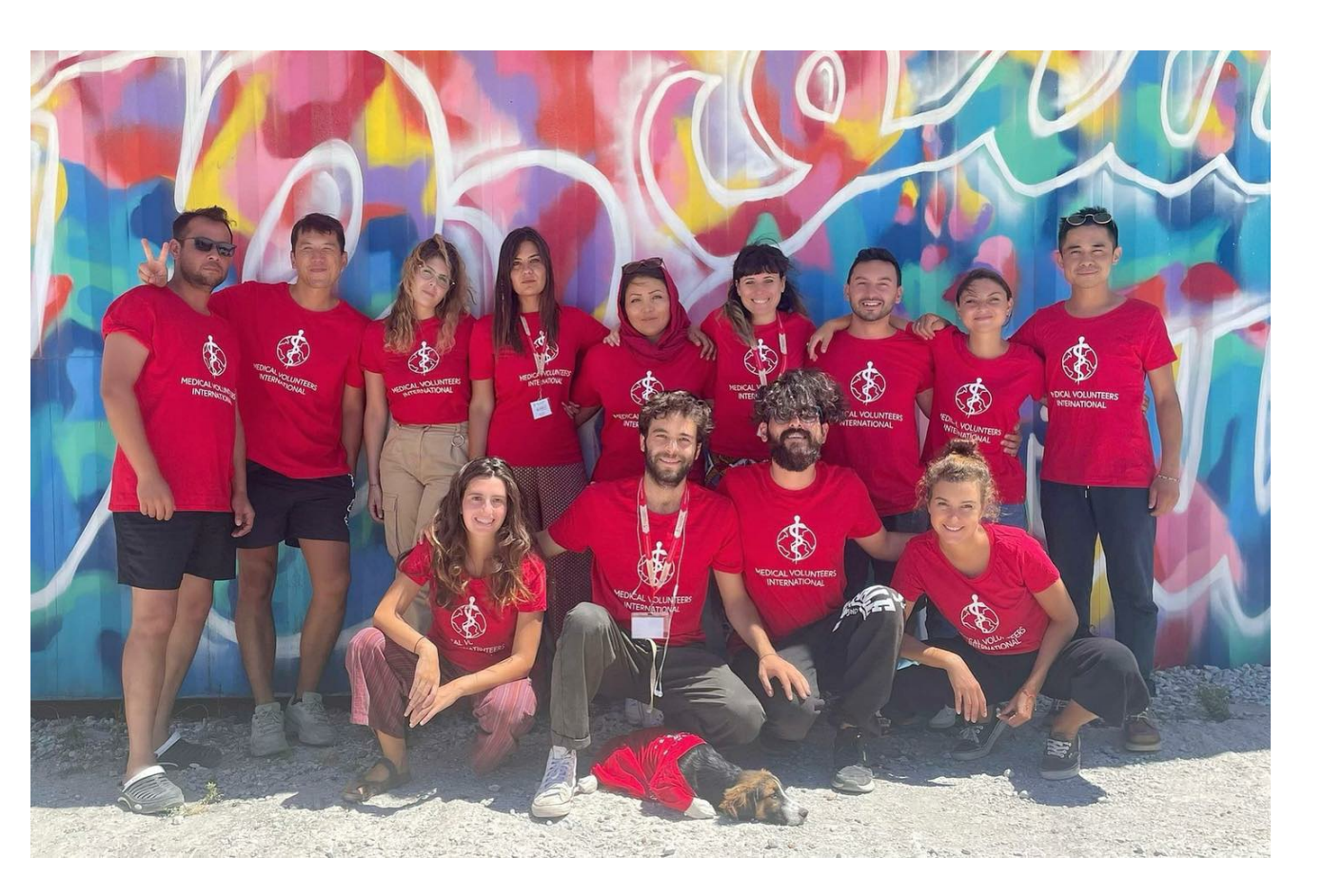
MVI team in Lesvos